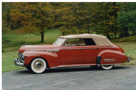
Rebecca - '41 Super Convertible Phaeton (467 Built)

I had arranged to take the Amtrak Auto Train from Sanford, Florida to Lorton, Virginia (just south of D.C.) and then drive "Rowdy" 355 miles home to Grahamsville, New York to meet the rest of the gang . . .