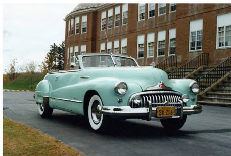
Rita - '48 Roadmaster Convertible (11503 Built)