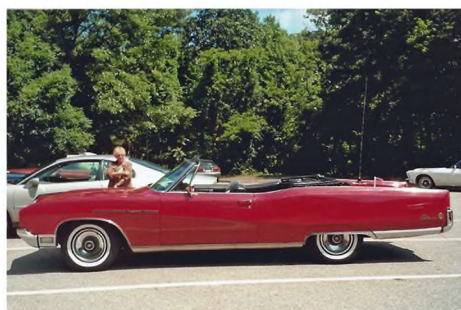
Roz - '68 Electra 225 Custom Convertible - (7976 Built)