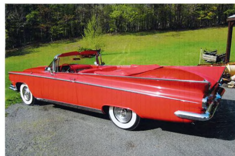
Roxanne - '59 Invicta Convertible (5447 Built)