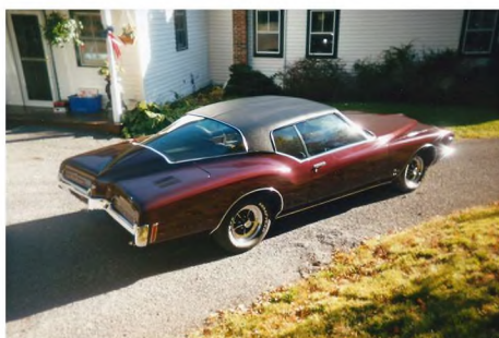
Rocky - '71 Riviera GS 455 (3175 Built)