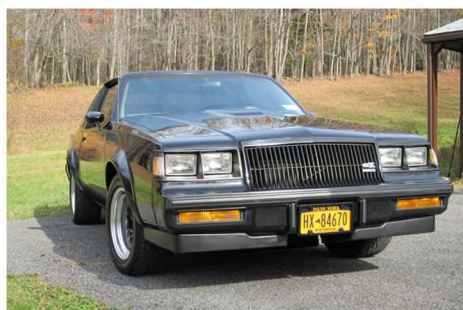
Rowdy - '87 GNX (547 Built)

A week after I got Rowdy home it snowed and the township salted the roads. That was October 10, 2017. Needless to say, Rowdy and I are anxiously waiting for Spring to be sprung. We will see y'all somewhere down the road . . . Soon . . . Fast!!!